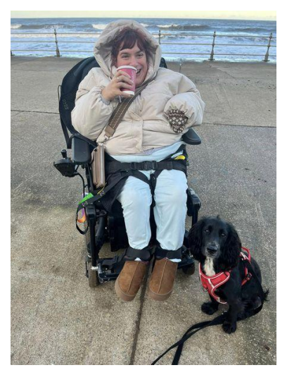
Care, Respect, Empowerment, Trust and Integrity